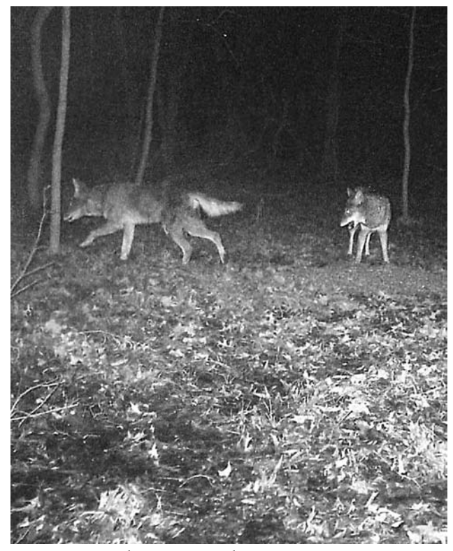
FOHMP Newsletter - April 2007 Page 3